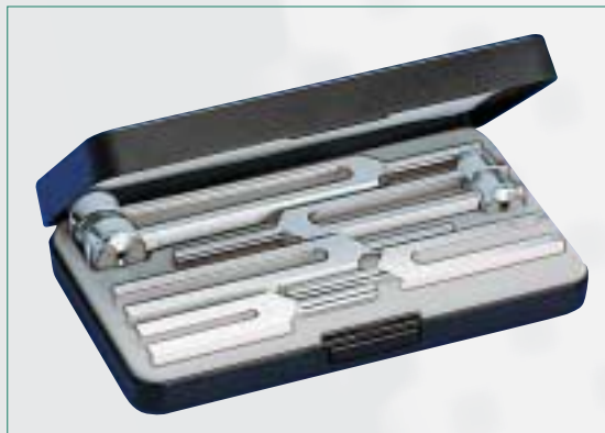
No. 5142 Set III 5 tuning forks made of aluminium (No. 5162, No. 5165, No. 5167, No. 5169, No. 5171) in plastic case

Rudolf Riester GmbH & Co. KG P.O. Box 35 • DE-72417 Jungingen Germany Tel.: (00 49) 74 77/92 70-0 Fax: (00 49) 74 77/92 70-70 info@riester.de www.riester.de