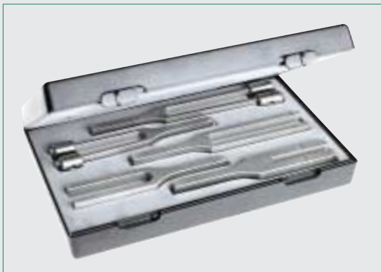
No. 5141 Set II 5 tuning forks made of steel (No. 5161, No. 5164, No. 5166, No. 5168, No. 5170) in plastic case