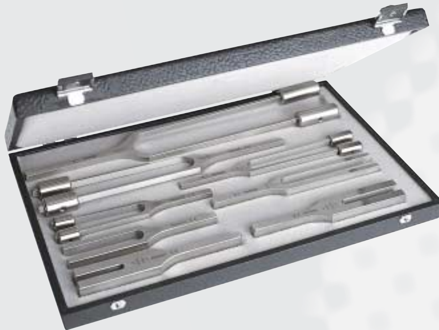
No. 5140 Set I 8 tuning forks made of steel (No. 5163, No. 5160, No. 5161, No. 5164, No. 5166, No. 5168, No. 5170, No. 5172) in wooden case

The tuning fork sets are well thought-out combinations in an attractive practical wooden or plastic case to perform full hearing tests. The most important frequencies are all conveniently to hand.